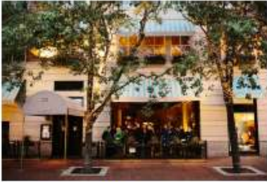
Terrace Accessible (weather permitting)